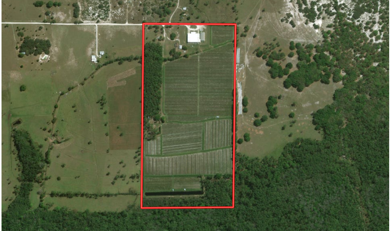
SEBRING FARM AERIAL MAP