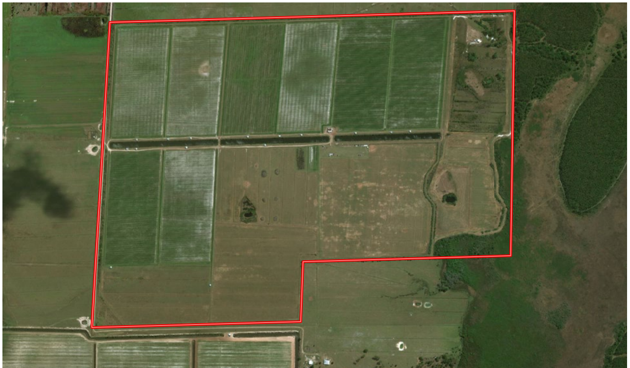
VENUS FARM AERIAL MAP