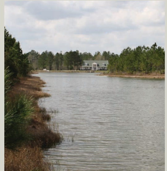
LODGE & LAKE AT QUAIL CREEK